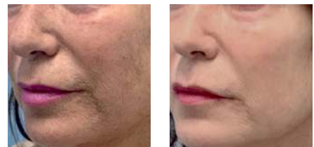
Results after 3 TriBella™ treatments